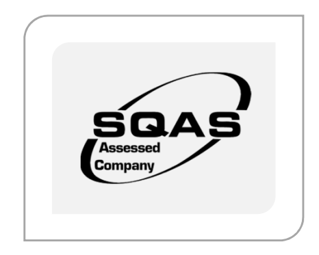
SQAS Lando, Hammer & Co.