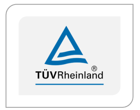
ISO – 9001:2015 Quality Management ISO – 14001:2015